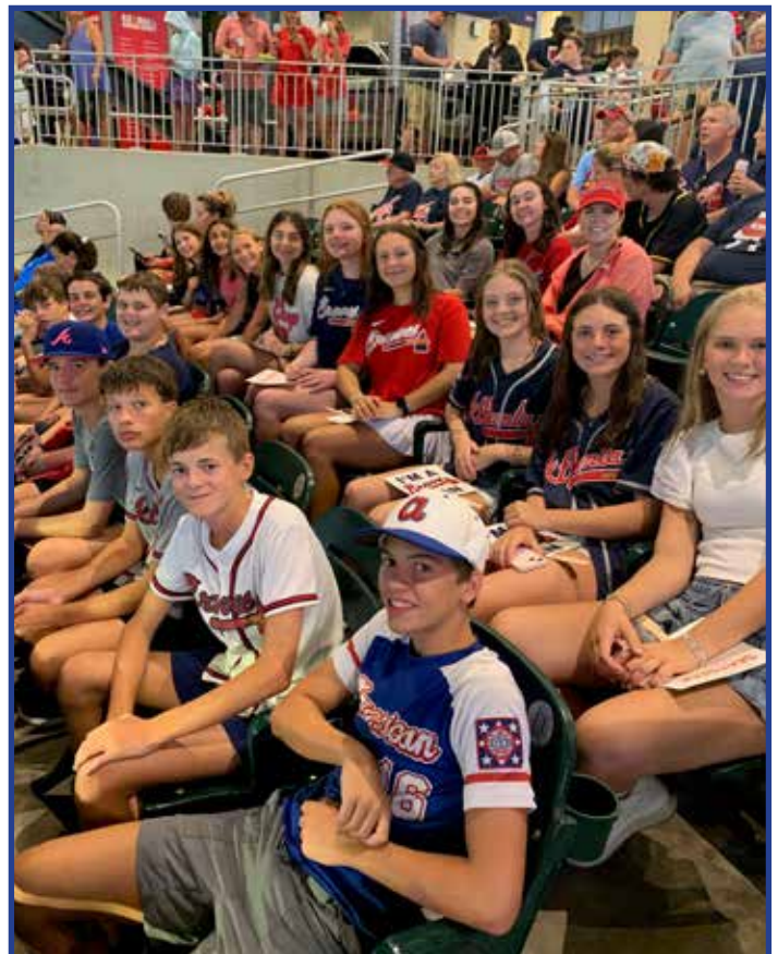
Watching the Atlanta Braves