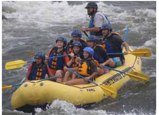
White water rafting