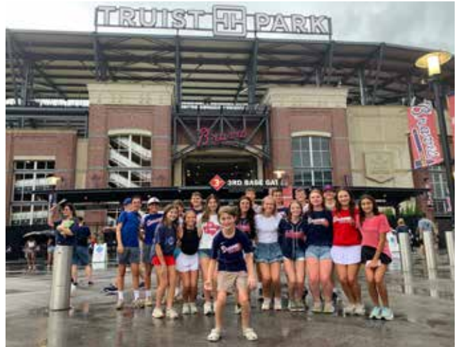
Atlanta Braves at Truist Park