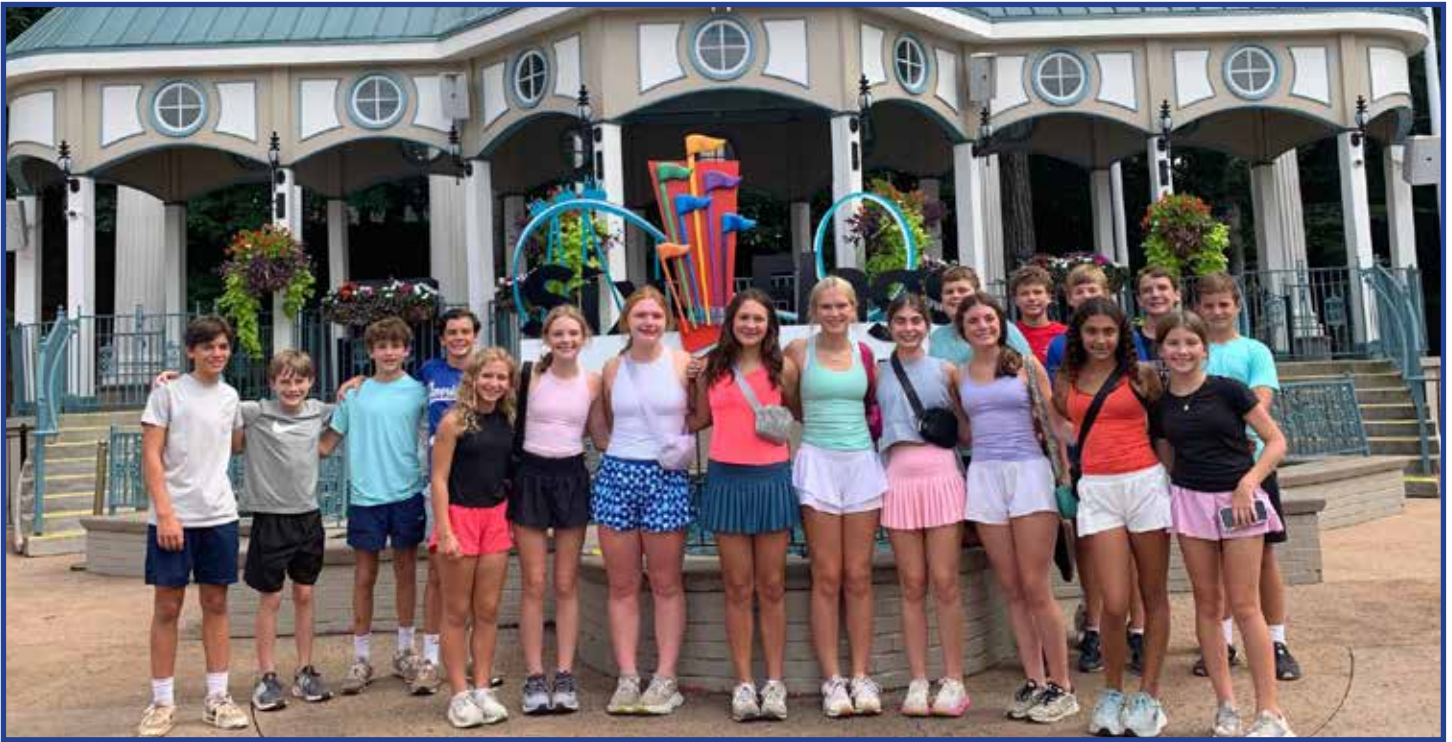
Six Flags Over Georgia