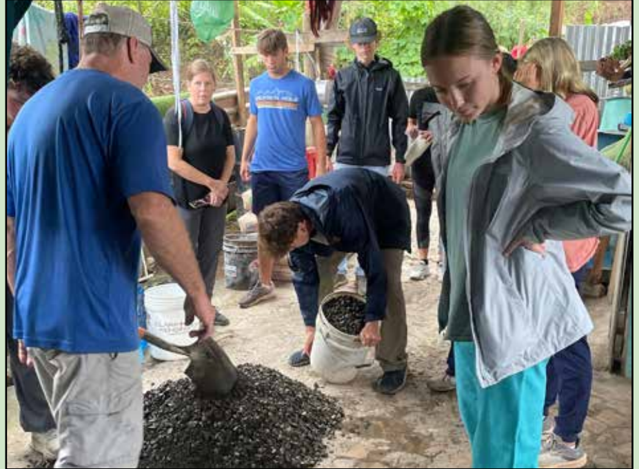
Concrete flooring project

We provided tutoring in math, reading, and English, and engaged with the children and staff in spirited soccer matches.